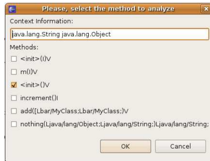
Fig. 5. COSTA Plugin Methods Selection

one can analyze one or several methods from a class (see Fig. 5) or the whole class (by running the analysis on all its methods). The results of the analysis are shown using markers in the source code (see Fig. 4). Such markers are different depending on the cost model used for analysis. In addition, the plugin also shows all previous analysis results in an additional view, which we call “the COSTA view”. The COSTA view also includes a warning icon for methods whose termination is not proved, in order to alert the programmer about potential problems. It can also read comments in the source code, written in Javadoc style, in order to set up analysis information.